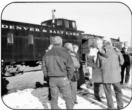
Preservationists visit the Colorado Railroad Museum

1. Time has really passed in a hurry. I hope the New Year is treating everyone all right. Colorado certainly needs snow. Lakes and reservoirs are below 50% filled.